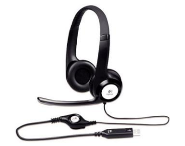
Figure 1. Headset with USB Connection

If you are conducting a low budget individual podcast or if your interviewee in a podcast is at another location you may be able to use a headset along with a computer. The type of headset you should use is one that you plug into a computer with a USB connection as shown in figure 1. This headset retails for around $25.00. A wireless headset or ear buds are NOT recommended.